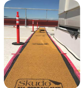
Safely Direct Traffic through a Jobsite - including TPO Roofs