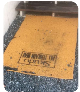
Use over Mud & Rocks