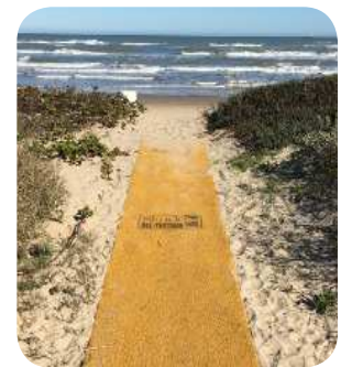
Perfect for Beach Access Paths