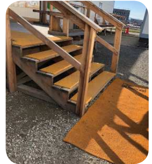
Traps Dirt & Debris

For jobsites with rough terrain, heavy rain, mud, snow and ice, Skudo's All-Terrain Mat is the solution.