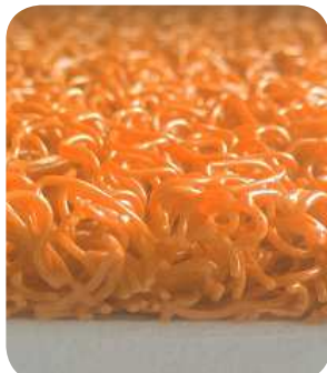
Thick, Heavy Duty Surface